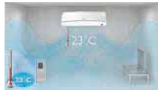
With “Follow Me”