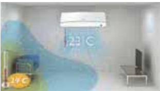
Without “Follow Me”

In most air conditioners the temperature sensor is located in the Indoor unit. In larger rooms, this may result in temperature differences in different parts of the room. One solution is the “Follow Me” function. Just press the button and the remote control acts as the temperature sensor to deliver you improved comfort wherever you are.